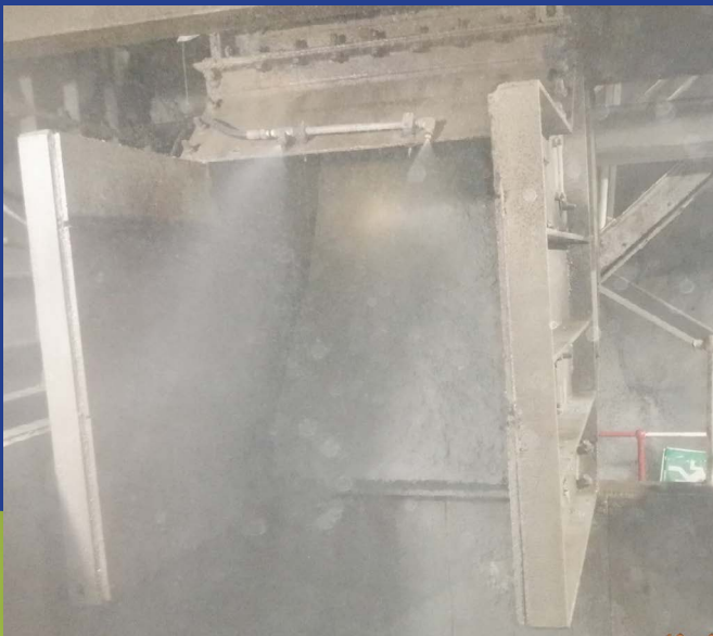
BOX FRONT TO CONVEYOR SPRAY BARS