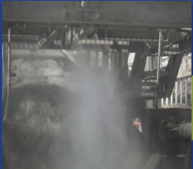
VIBRATOR TO CONVEYOR FEEDING SPRAY BAR