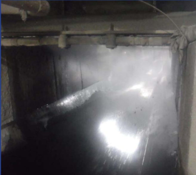
CONVEYOR TRANSFER SPRAY BAR