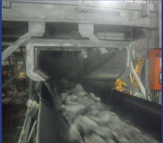
NO DUST AT TRANSFER CHUTE