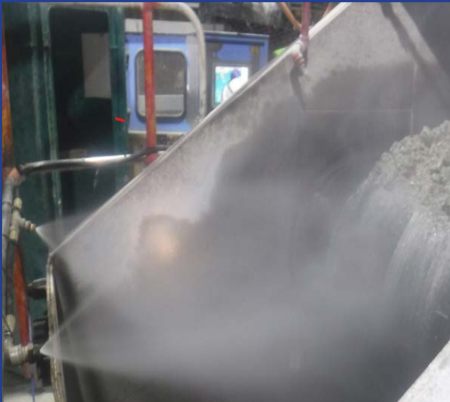
OPEN TRANSFER CHUTE SPRAY BAR